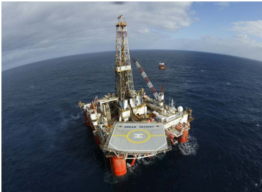
New Seaclem-1 in PEP11, offshore Sydney Basin, will be drilled by the semi submersible rig "Ocean Patriot".

Advent is pleased to advise that it has now received all necessary statutory approvals and drilling permits to permit the drilling of New Seaclem-1 in PEP 11. Under its internal control procedures, Advent will continue to comply with the regulations and the terms and conditions of the permits and approvals issued.