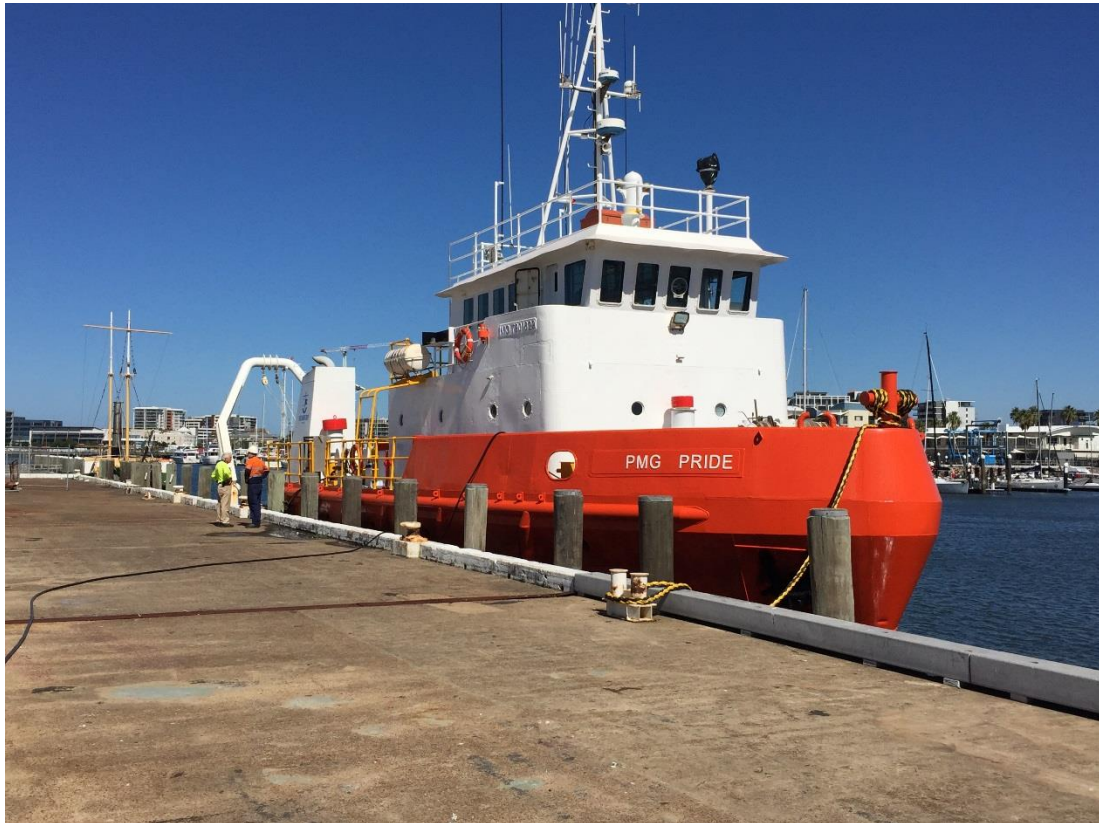
Utility vessel engaged to undertake the Baleen 2D HR Seismic Survey